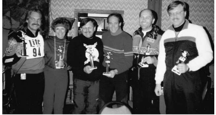
Six skiers who USED to be fast!!!!!!